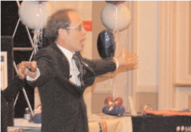
Keynote Speaker, Dennis Embry, Ph.D., addressing the growing prescription and over-the-counter drug abuse problem

The annual NJPN prevention conference once again attracted another new record-high attendance as over 700 attendees packed the conference center in Long Branch. The 7th annual conference’s overall theme focused on the growing problem of prescription and over-the-counter (OTC) drug use.