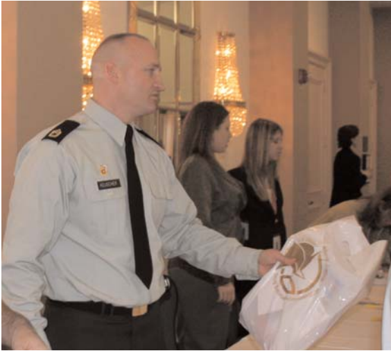
The New Jersey National Guard distributes conference materials to the conference attendees