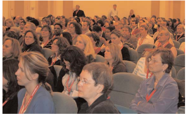
Over 700 people packed the one-day event